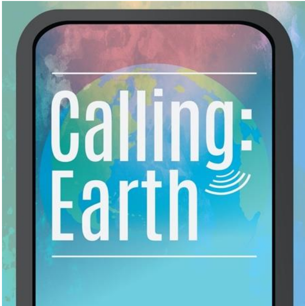
Figure 1. Season 1 Logo

The first logo continued to be used for the entire first season, but before the second season was released, the library's new communications and marketing coordinator assisted with the creation of a new logo that looked more sophisticated and more in-line with other podcast logos. Having an in-house graphics designer was extremely helpful in rolling out a new logo (See figures 1 and 2).